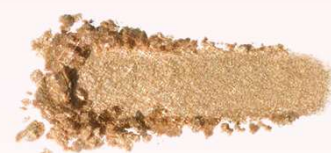
Hypnotic LIGHT GOLD SPARKLE