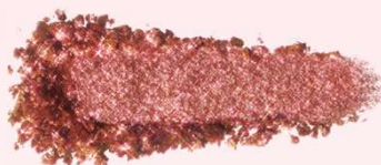
Heart Eyes SHIFTING WARM ROSE GOLD SPARKLE