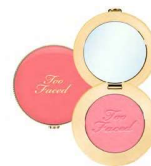
Cloud Crush Blush