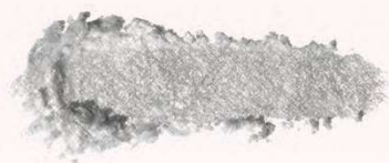
Fairy Dust OPALESCENT PLATINUM SPARKLE