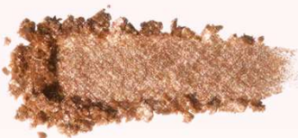
Magic Sparkles ROSÉ CHAMPAGNE SPARKLE